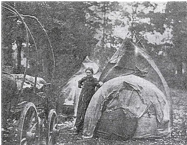
5. A gipsy camp at Alperton, early 1900s.

“boarder”, aged 22, whose occupation was ‘clothes peg maker’. Both of the other family groups included pedlar/hawkers, and all had been born at various locations around London.